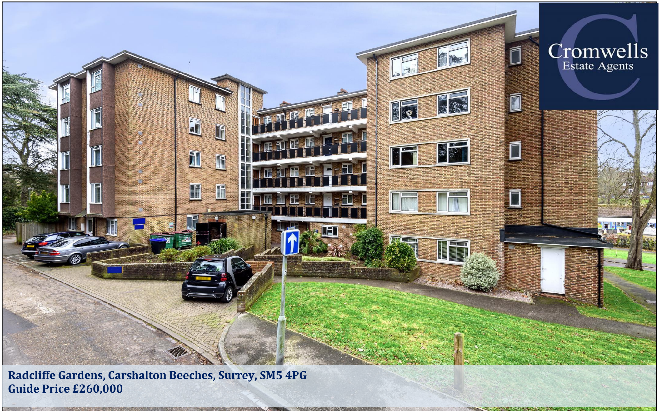
Radcliffe Gardens, Carshalton Beeches, Surrey, SM5 4PG Guide Price £260,000

Cromwells are pleased to present to the market this conveniently located two bedroom, second floor apartment. The property benefits from two double bedrooms with built in wardrobes, a dual aspect reception room, kitchen and bathroom. In need of modernisation, this property would be ideally suited for first time buyers, investment purchasers and downsizers. It is situated within walking distance of both Carshalton Beeches High Street and train station, as well as local schools and bus routes. No chain and long lease.